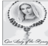
Our Lady of the Rosary